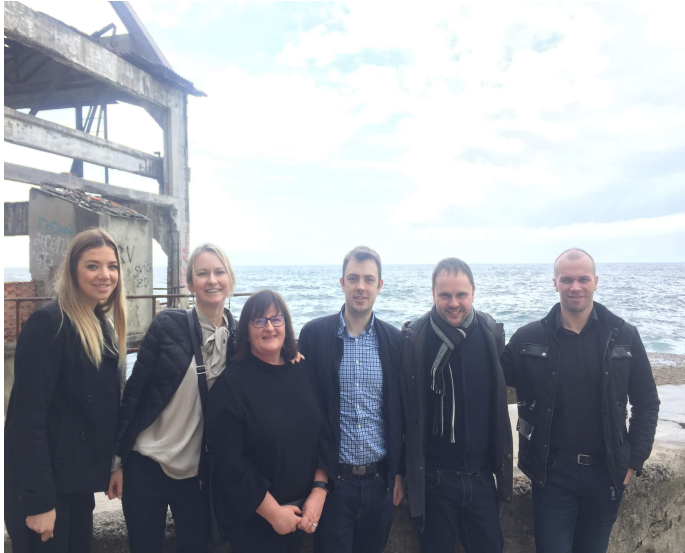
In April, 2019 the partner meeting was held in the beautiful location of Rijecka, Croatia.

Momentum were delighted to host a very interesting and successful partner meeting in County Leitrim, Ireland.